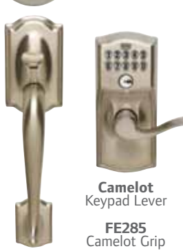
Camelot Keypad Lever FE285 Camelot Grip