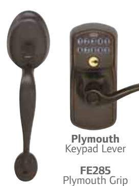
Plymouth Keypad Lever FE285 Plymouth Grip