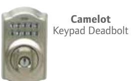
Camelot Keypad Deadbolt

*Additional finishes available special order.